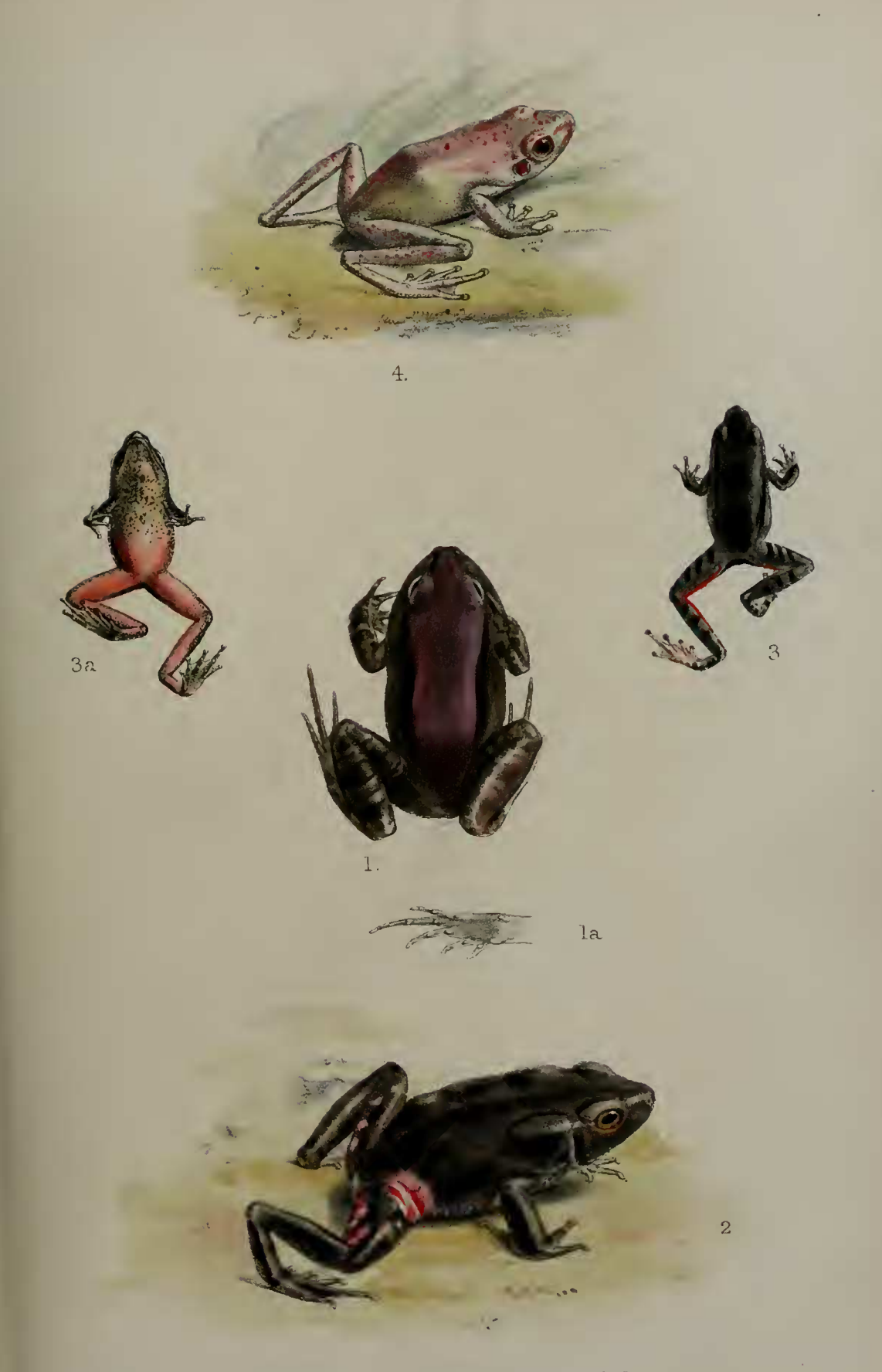
1 Cystignathus rhodonotus 2 Bufo glaberrimus. 3.Ixalus opisthorholus 4 Hyla rhodoporus.